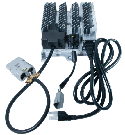
Above: IC650 "Comm" Charger with optional AC, DC and signal cables.